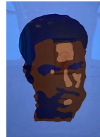
Me, Myself, & I , 2020 Monoprint 25 1/4" x 19 1/4"