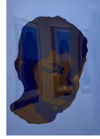
OreO , 2020 Monoprint 25 1/4" x 19 1/4"