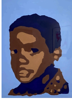
Omniboi , 2020 Monoprint 25 1/4" x 19 1/4"