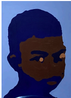
Daddy's Baby , 2020 Monoprint 25 1/4" x 19 1/4"