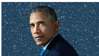
All American , 2020