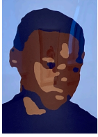
Mr. Big Shot , 2020 Monoprint 25 1/4" x 19 1/4"