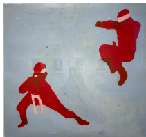
Heroes of the East , 2019