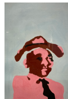
Reckoning II , 2018