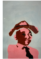
Reckoning I , 2018